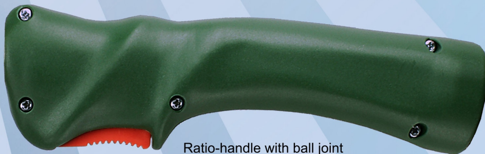
Ratio-handle with ball joint part No. 91912534