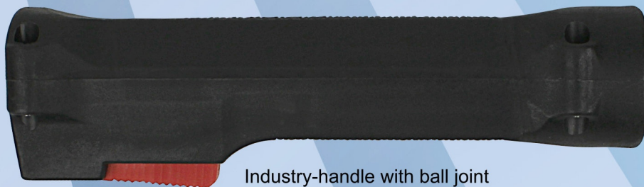
Industry-handle with ball joint part No. 91912101