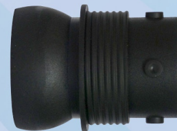
Ball joint part No. 91912704