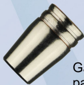
Gas nozzle conical ID12,5 mm part No. 20193002